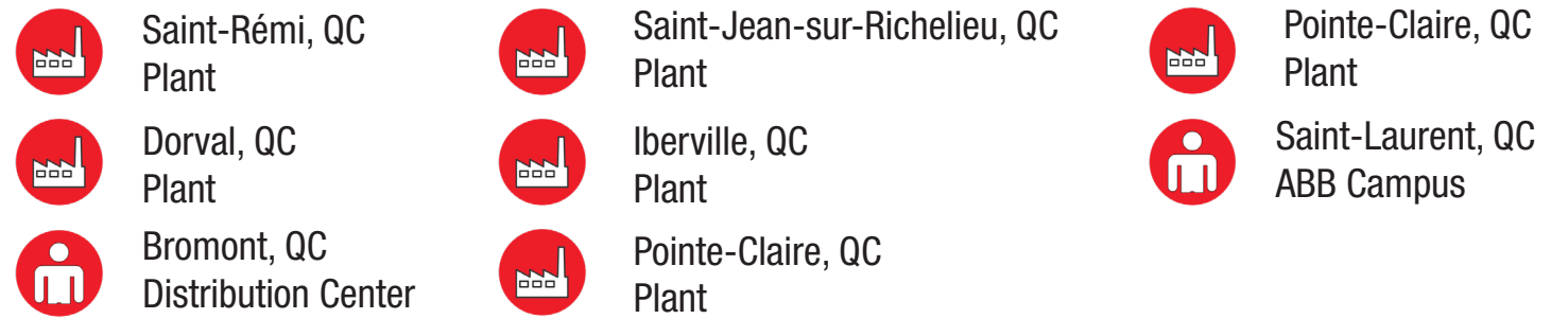
ABB Canada offers several categories of products to its customers, which are manufactured in Canada, including electrical boxes and covers, Iberville brand fittings, a well-known brand here, since it is manufactured at the Saint-Jean-sur-Richelieu plant. We also offer Red Dot and Carlon weatherproof products that are manufactured at one of our plants in Montreal. Marrette brand wire connectors and emergency lighting products are manufactured in other factories located in Montreal. Microelectric meter sockets and accessories are manufactured at our Iberville plant.

An item or material for which at least 51% of the direct costs of manufacturing (materials and labour) were incurred in Canada. Included in the calculation: production, assembly, packaging. Excluded: overheads, research and development, design, transport.