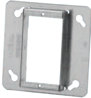
52C49-1/2-CRT – CI52-C-51-2